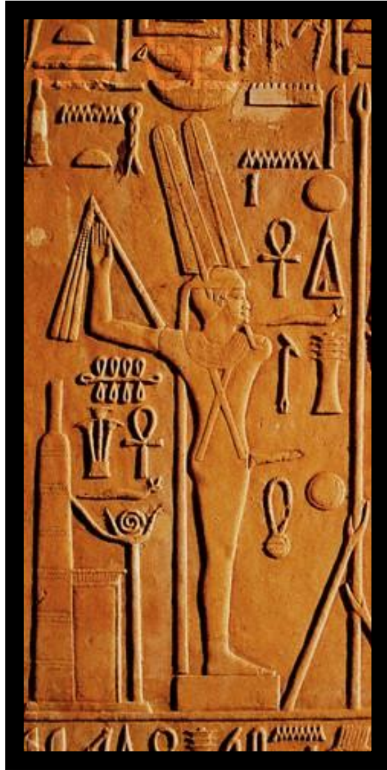
Amen-Men (Min, Amen-Min, Orisha Oko)