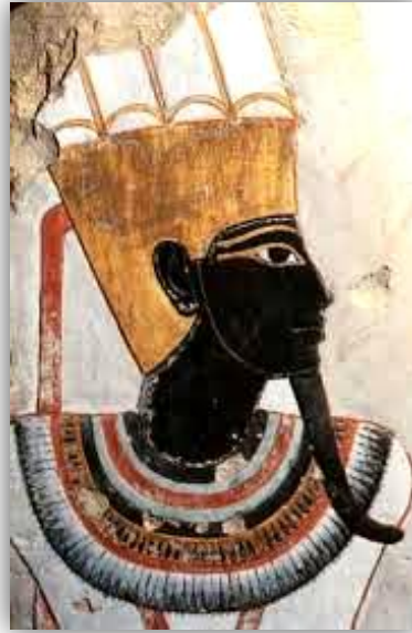
Images of the Axis/Central Nervous System, Men and Amen-Men. The cord connecting the back of the head of the Obosom to the Asaase (Earth) represents the spinal cord while the rounded and flat crowns represent the brain.

[The name Amen was stolen by the whites, misdefined and misused when praying to their fictional characters : jesus, yahweh, allah, in their false religions of christianity, judaism/hebrewism and islam. The name Per Amen was also corrupted by the whites into brahmin and attached to their fictional character brahmin in their false religion of hinduism.]