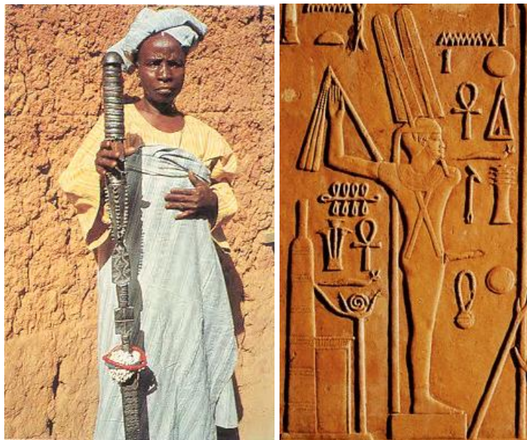
Above: Iyawo Orisha Oko holding an opa (staff) with the oko (phallus) emblem. This emblem is the emblem of the ka (oko/phallus) of Men. Men is called He of the Great Ka (oko) in Kamit. Men Ka Mut f and Orisha l'Oko are One and the same.

Orisha Oko is the Orisha associated with fertility . His description as the hunter who became settled in the farm is a manifestation of the male "hunting" ( seeking ) the female ( sperm seeking the ovum ). Once fertilization occurs, he is no longer a hunter but now sedentary.